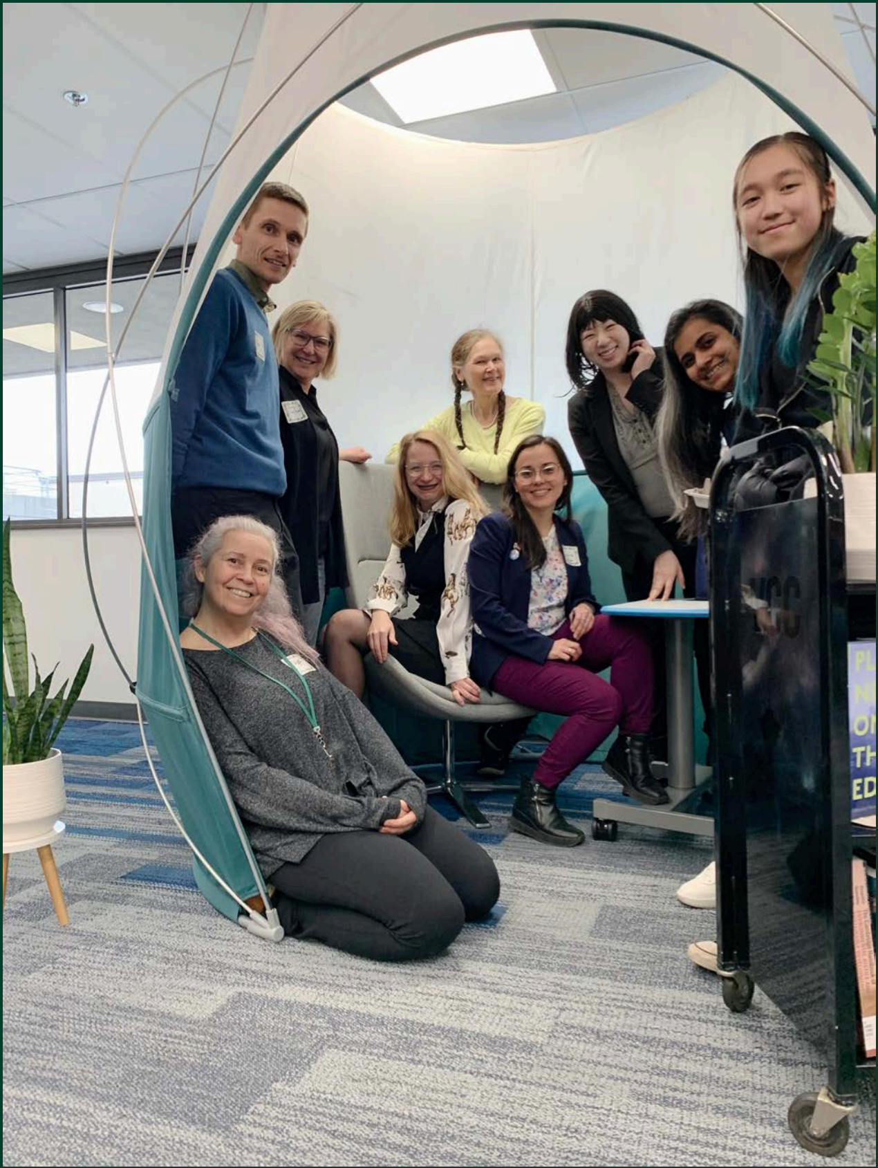
Eco Grant Celebration of Achievements campus tour of the projects.