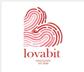
Top left: Lovabit logo design Bottom left: Lenz Dog Training logo