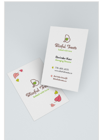
Above: Blissful Treats business cards Left: Ronald Macdonald House Garage illustration