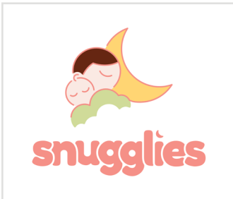
Above: Snugglies logo design and brand identity